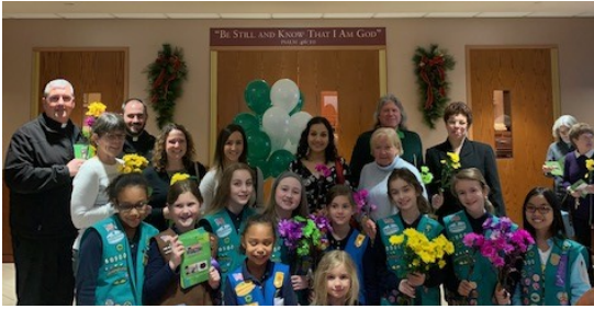
WE ARE SO THANKFUL!