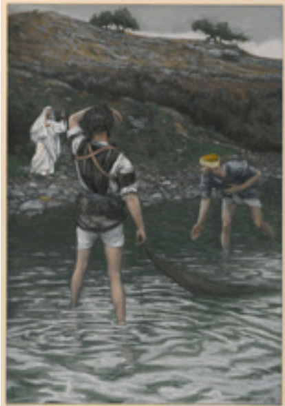
James Tissot, 1886-1894

Isaiah 6:1-2a, 3-8 Psalm 138:1-2, 2-3, 4-5, 7-8 1 Corinthians 15:1-11 Luke 5:1-11