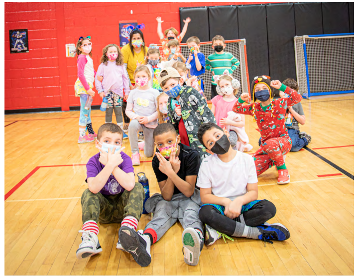
Second graders really take Wacky Tacky Day very seriously...

For one of our student service projects during CSW, students collected supplies for children entering foster care in Onondaga County. Once supplies were collected, students worked together to pack them into backpacks and made cards to include in the bags.