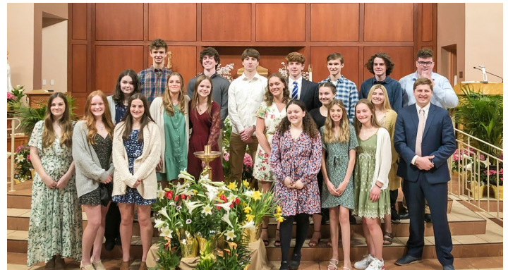
Teens and leaders from our youth discipleship group (Lux Mundi) celebrated and welcomed their friend into the Church at the Easter Vigil.