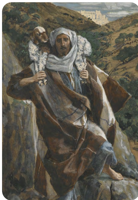
The Good Shepherd James Tissot, 1886-1894

In a particular way, this is also a Sunday where we intentionally pray for priests and those discerning the vocation to the priesthood. We hear proclaimed boldly the incredible standard your priests must live up to as they are called to radically imitate Jesus the High Priest and Good Shepherd. Unlike the priests of the Levitical covenant, Jesus not only makes the offering, he himself became the offering on the cross. Unlike the typi-