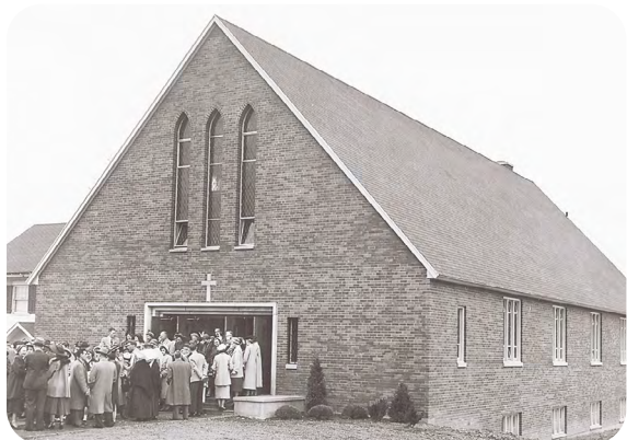
The church dedication on April 23, 1950

Cross. In 2002, then pastor of the parish, Msgr. J. Robert Yeazel and the Parish Council voted unanimously to build a new church. On September 14, 2006, that church was dedicated on the Feast of the Holy Cross.