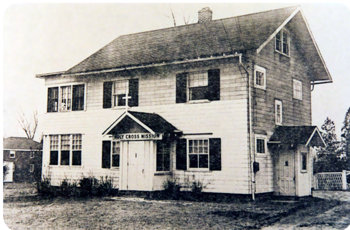
The house used as the mission church and catechetical center, 1943